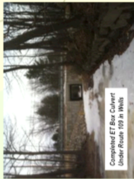
Completed ET Box Culvert Under Route 109 in Wells

The proposed Off-Road Eastern Trail follows the abandoned Eastern Railroad corridor, starting in South Berwick (Rts 236 & 91), near the old Roundhouse foundation. The trail continues through North Berwick with a short on-road section, then off-road again from Pratt-Whitney, through Wells' new open space, Perkinsown Commons (access easements to Quarry Rd, Perry Oliver Rd, Rt 9), ultimately connecting with the current southern end of the off-road trail at Warren's Way & Rt 35 in Kennebunk.