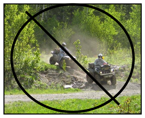
Motorized Travel Not Allowed on Eastern Trail -Law Enforcement is Working

As the trail expands into rural areas of the Kennebunk, Arundel and Wells, it is expected that ATV trespassing will continue to be an issue. As the ETA and ETMD work hard to expand this off-road trail, municipalities and trail advocates must continue to educate citizens and local ATV clubs about rules of the trail and work with neighboring municipalities in patrolling the trail. Not only does a police presence on the Eastern Trail assist in keeping motorized vehicles off of the trail, it makes the trail a safer place for all trail users.